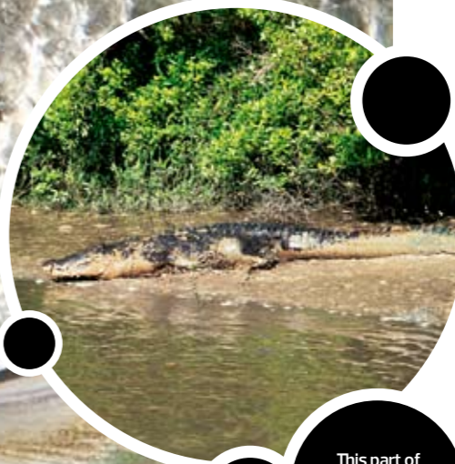
This part of Arnhemland also has plenty of crocodiles!

G UIDED FISHING businesses, specialised lodges and live-aboard mother ship operations come and go with the passage of time. The best of them may last a decade or more, but it seems that in this tough and competitive game, all good things eventually come to an end. Guides and owners burn out, infrastructure deteriorates and, sadly, fishing conditions do change. In my 30-odd years as a writer I've watched my fair share of booms and busts in the guided fishing industry. Along the way I've learnt not to become too attached to any particular operation, but it's still hard not to pick favourites.