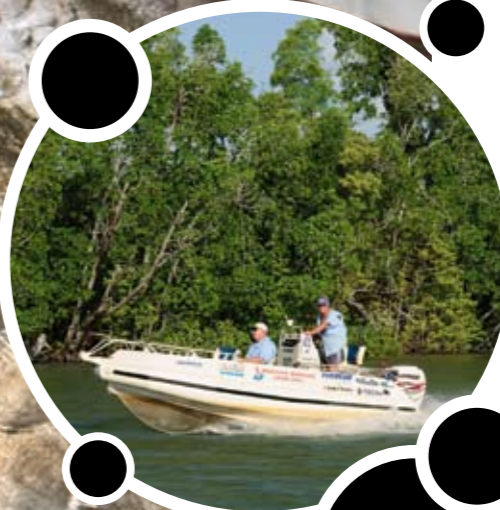
The Lodge runs a fleet of E-Tec-powered Ocean Master boats.