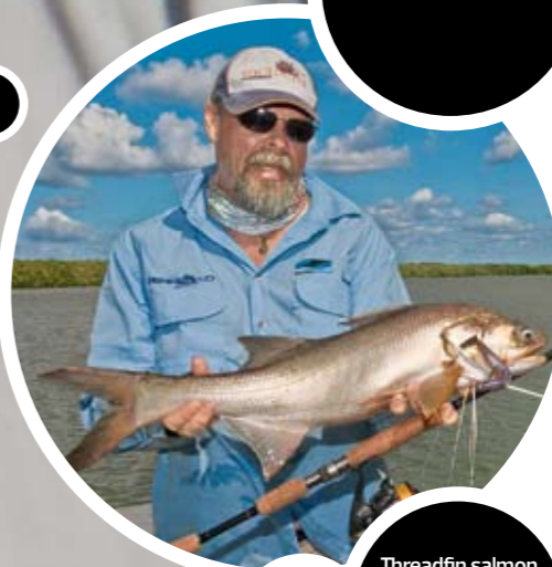
Threadfin salmon and a host of other species are on tap in these prolific waters.