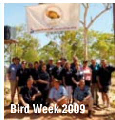
Bird Week 2009