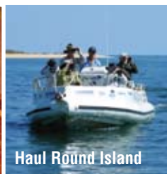
Haul Round Island