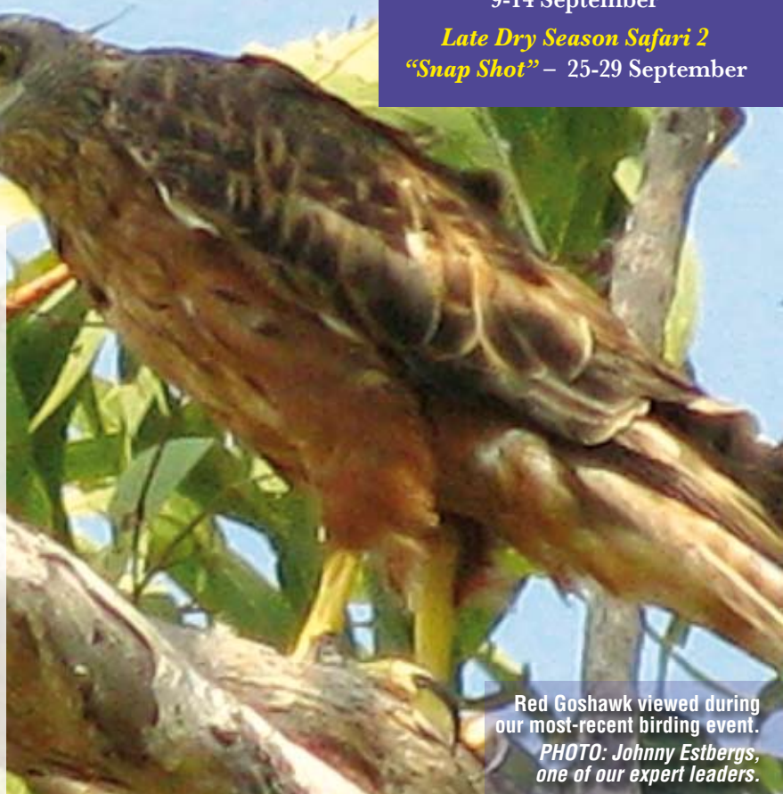
Red Goshawk viewed during our most-recent birding event.