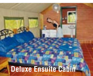
Deluxe Ensuite Cabin