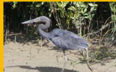
Great-billed Heron, Blyth River.