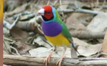
Gouldian Finch, Tomkinson floodplain.