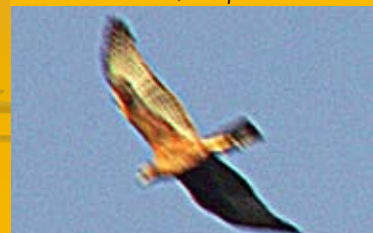
Red Goshawk, Crater Lake.