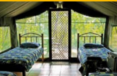
Deluxe ensuite cabin accommodation.

Because little birding has been done in the region, sightings of other rare birds may also occur.