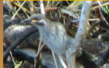
White-lined Honeyeater near art site.