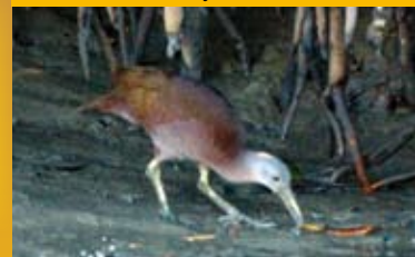
Chestnut Rail, Liverpool River.