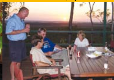
The sunset is always spectacular.