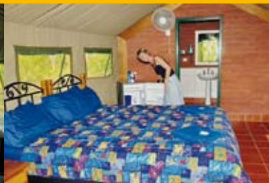
Deluxe ensuite cabin with double bed.